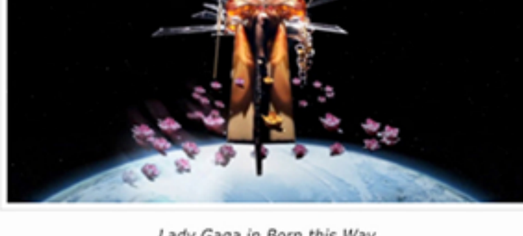
Lady Gaga in Born this Way

a bedroom made out of paper or a pair of rocking-horse shoes. She's who Lady Gaga turned to when she wanted a dress made out of stained-glass for her video 'Born this way'.